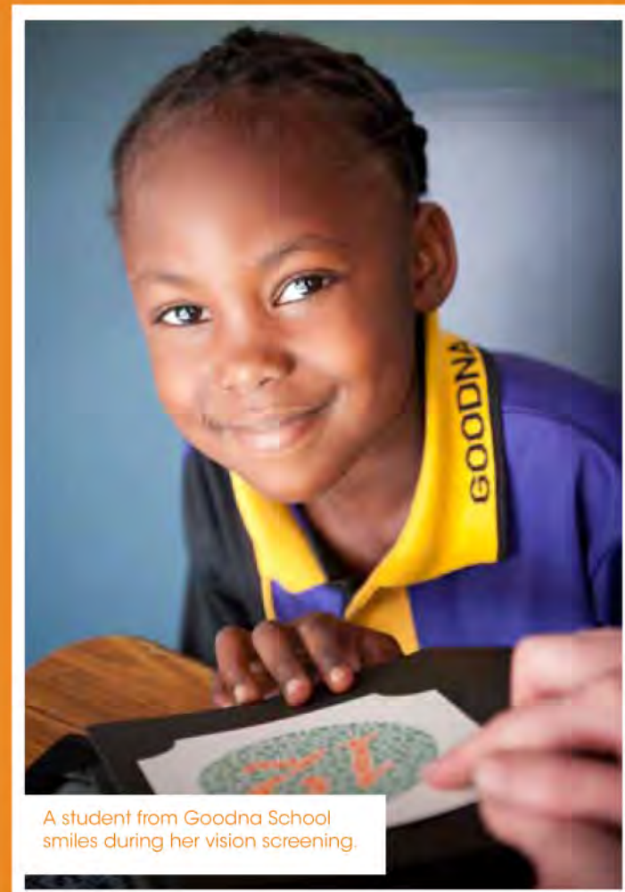
A student from Goodna School smiles during her vision screening.

OneSight's global volunteer base continues to grow! For the first time, employees located in Switzerland, United Arab Emirates, Argentina and Belgium applied for a OneSight Clinic. Additionally, OneSight Global Clinic teams will also welcome volunteers from China and India. Last year, these employees assisted in Regional Clinics, but are excited for the chance to help abroad. In total, Clinic volunteers represent 40 different Luxottica locations spanning 34 countries!