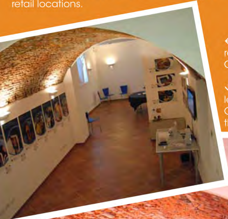
←The Lux Academy room prepared for OneSight presentations.

More than 300 Italian customers had the chance to learn about OneSight during 20 Lux Academy sessions held in Milan in late 2010. Each of the customers sell Luxottica product in their independent retail locations. During each Lux Academy session, customers learned about OneSight's history, mission and vision. Volunteers shared best practices and opportunities for customers to include OneSight in their stores. Many customers are already embracing OneSight by donating frames and lenses, holding eyewear collections and hosting OneSight weeks in their retail locations.