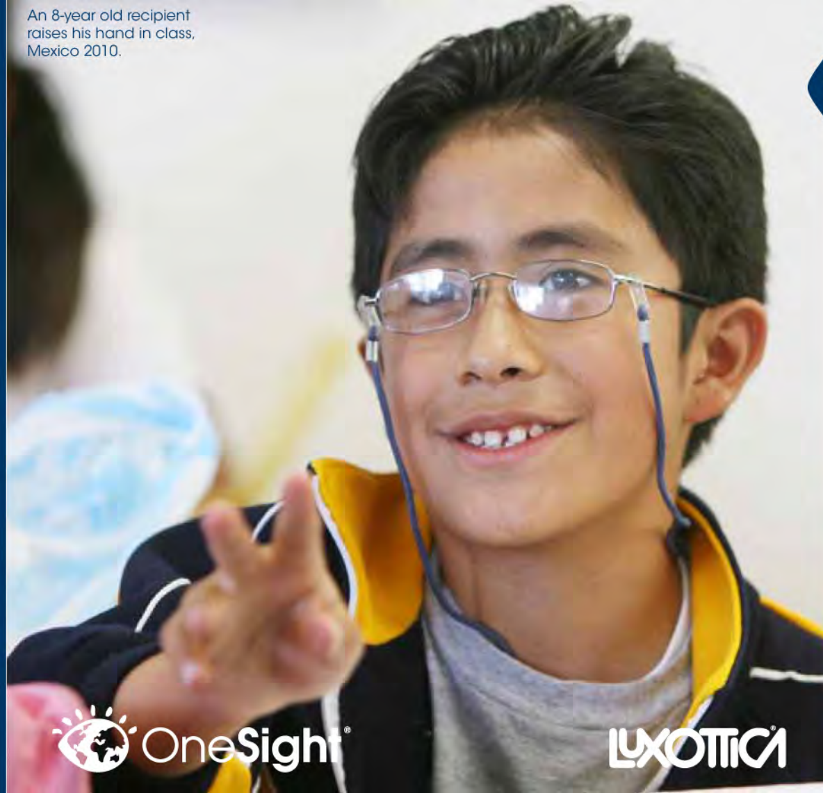
An 8-year old recipient raises his hand in class, Mexico 2010.