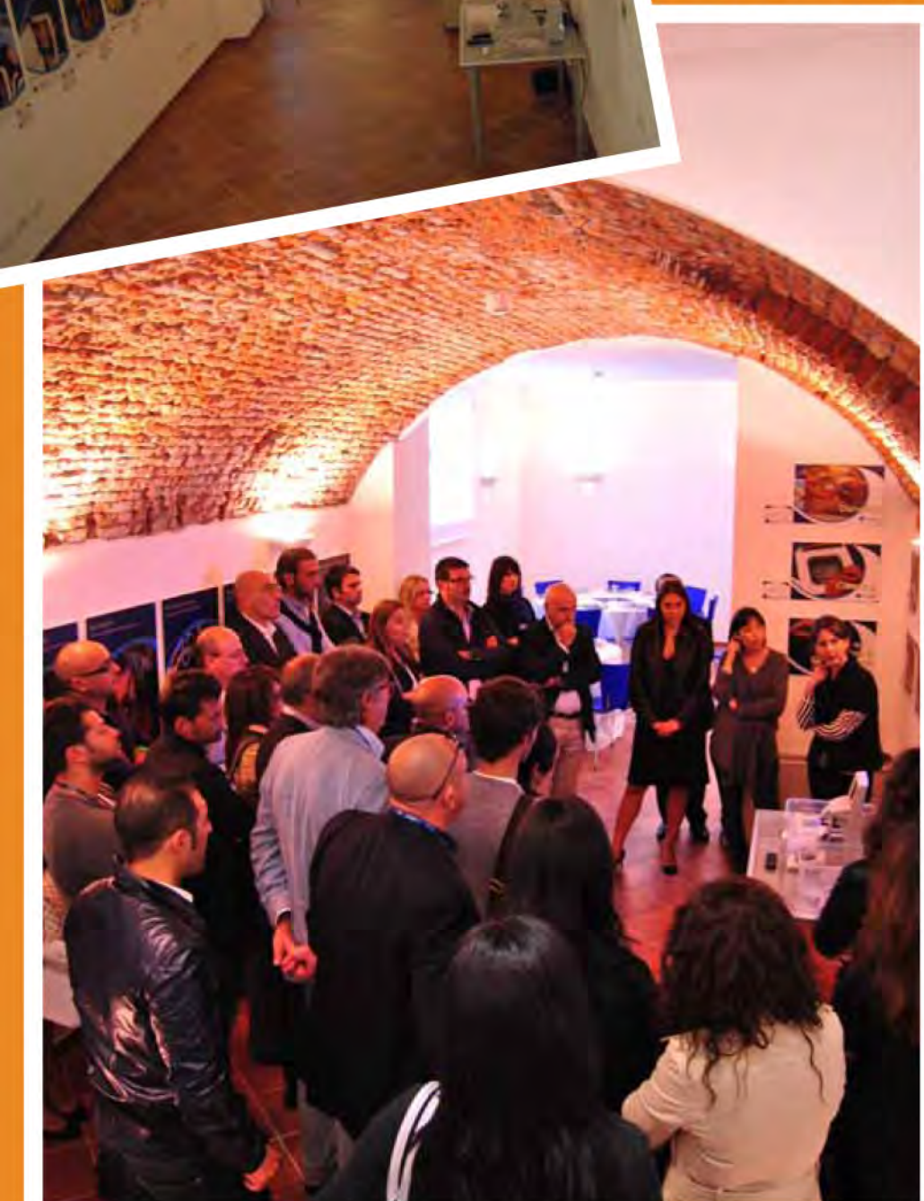
↓Italian customers learn about OneSight during the Lux Academy.