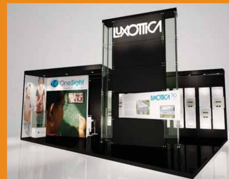
→ Luxottica Brazil's booth at Expo Abiotica educates customers on OneSight.

Brazilian customers are learning more about OneSight programs thanks to local Luxottica employees! During Expo Abiotica, the biggest optical trade show in Latin America, Luxottica Brazil hosted a booth. Employees shared photos, stories and information about OneSight programs during the three-day event. Customers were invited to get involved by hosting OneSight promotions and events in their retail locations.