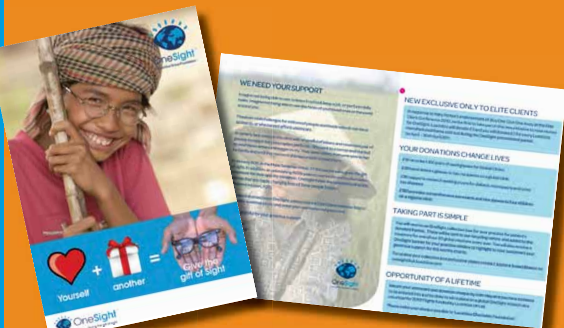
↑ Luxottica UK's promotional material encouraged Elite Client participation.

During the month of April, Luxottica UK's Elite Clients (top independent customers) made a £3 donation to OneSight for every Luxottica frame sold in their store. To raise awareness of this event, participating Elite Clients received a collection box and window banner highlighting their generous support to OneSight. Participating clients were also entered for a chance to attend a 2012 Global Clinic to see first-hand how OneSight changes lives.