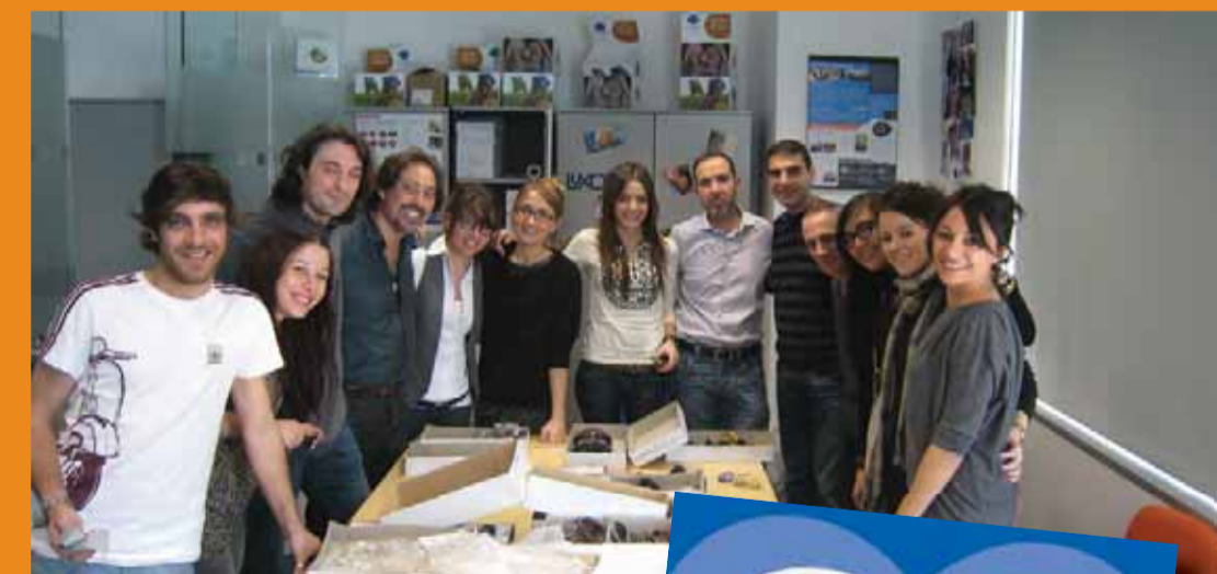
↑ Spanish employees prepare product for the sale.

Luxottica employees in Spain showed their love for OneSight by raising money during Valentine's Day. Spanish employees hosted a sunglass sale with a portion of all proceeds benefiting OneSight. Employees seized the opportunity to also sell local OneSight calendars featuring images of employees with Clinic recipients. In total, more than one thousand people visited the sale with € 6,600 raised for OneSight programs!