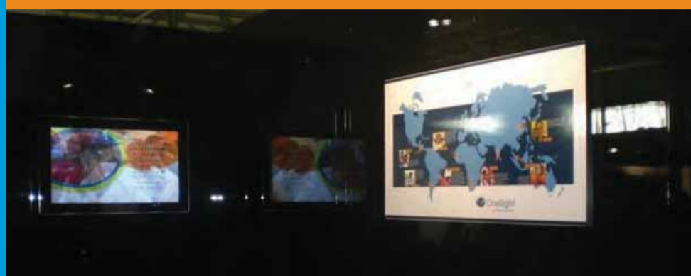
↑ OneSight posters show where volunteers have helped give the gift of sight.

OneSight recently had presence at two large events in Milan, Italy. The first was MIDO, the International Optics, Optometry and Ophthalmology Exhibition. This three-day event attracted people from all over the world to preview the latest trends in eyewear. Luxottica employees hosted an elegant booth that included space to tell the OneSight story through images and video.