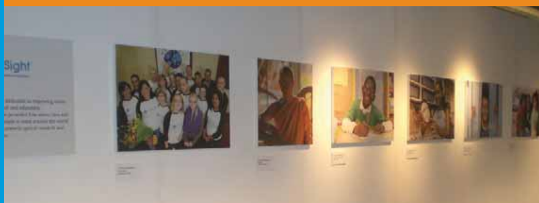
↑ Posters introduce attendees to OneSight "millionth" recipients.

The second event was Luxottica-sponsored Buying Days. Key clients from around the world attended this event to preview new Luxottica collections. Clients were introduced to OneSight through photos and stories. Each OneSight "millionth" recipient was featured along a long corridor to illustrate how volunteers help. The last picture described our focus areas for 2011 and how Luxottica customers can get involved. Baodao Optical, a key Luxottica Wholesale client from Mainland China's largest optical chains, expressed interest in exploring opportunities to bring more OneSight presence to China!